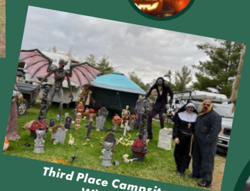
Third Place Campsite Winner