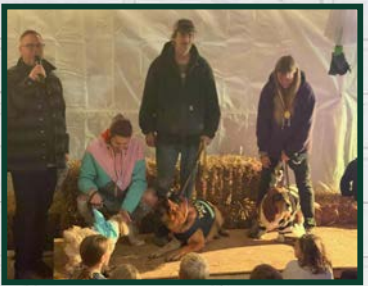
1st Prize: Bandit the Prisoner 2nd place: Jobie the Shark 3rd place: Max the Cop