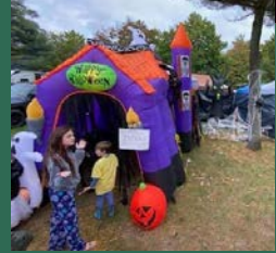
Second Place Campsite Winner